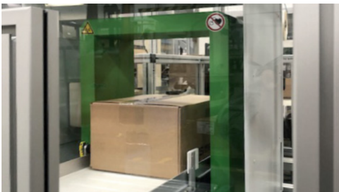
Active demagnetizing pulse for demagnetizing a box with bulk material