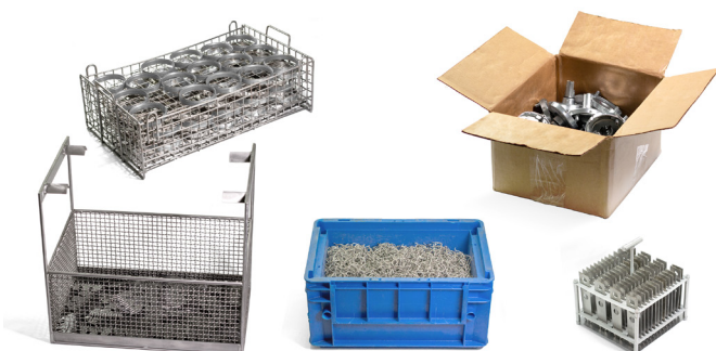
Especially suited for demagnetizing parts inside of non-metallic (non-ferromagnetic) laundry baskets or containers