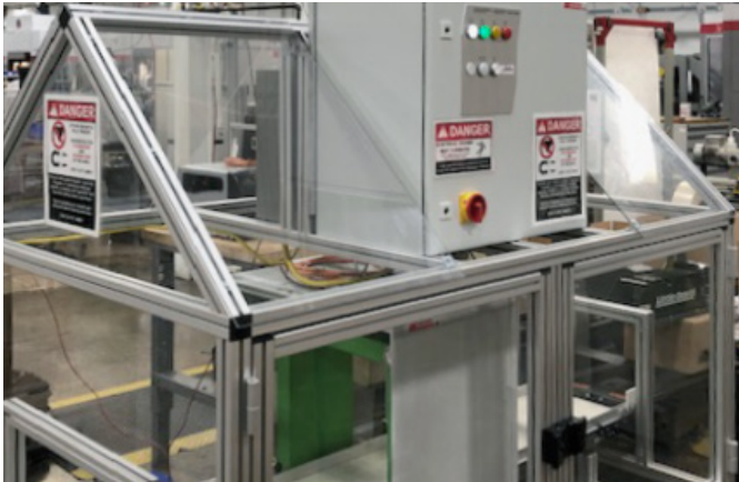
SE+DN in a fully automated production line